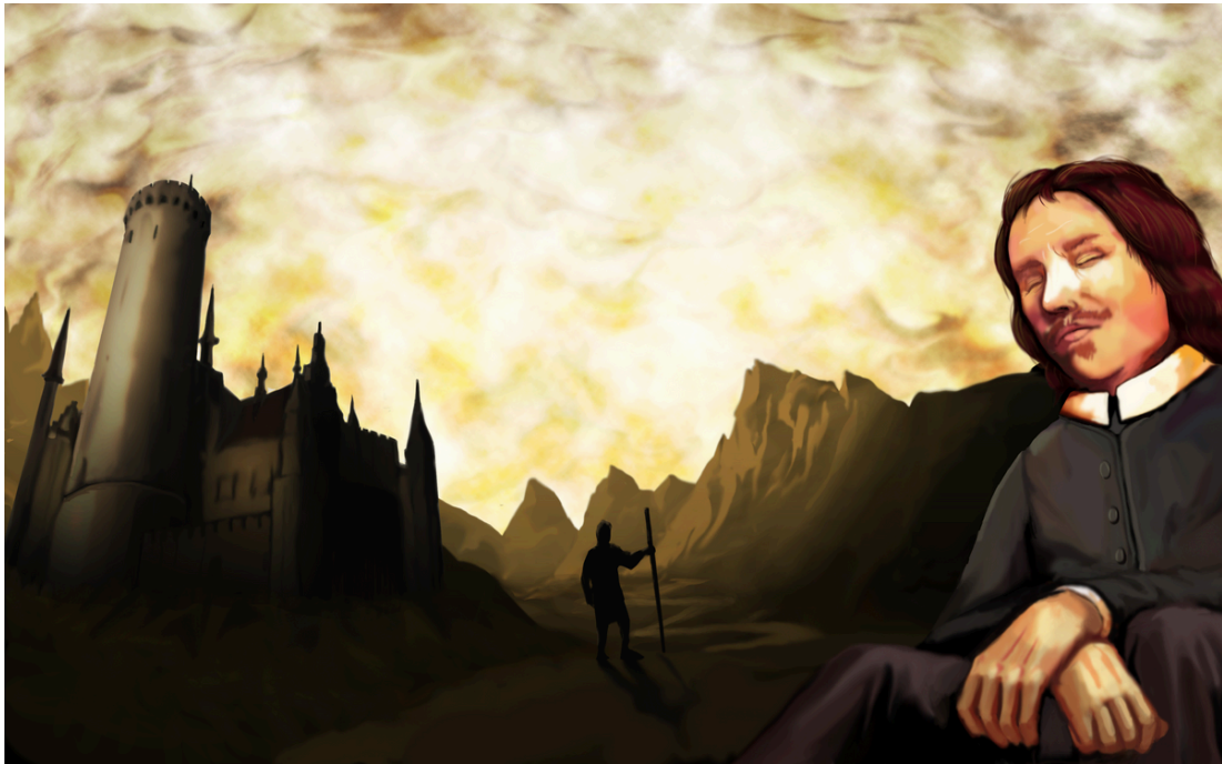
ILLUSTRATION BY DANIEL GIESBRECHT

NEWSLETTER OF THE INTERNATIONAL JOHN BUNYAN SOCIETY