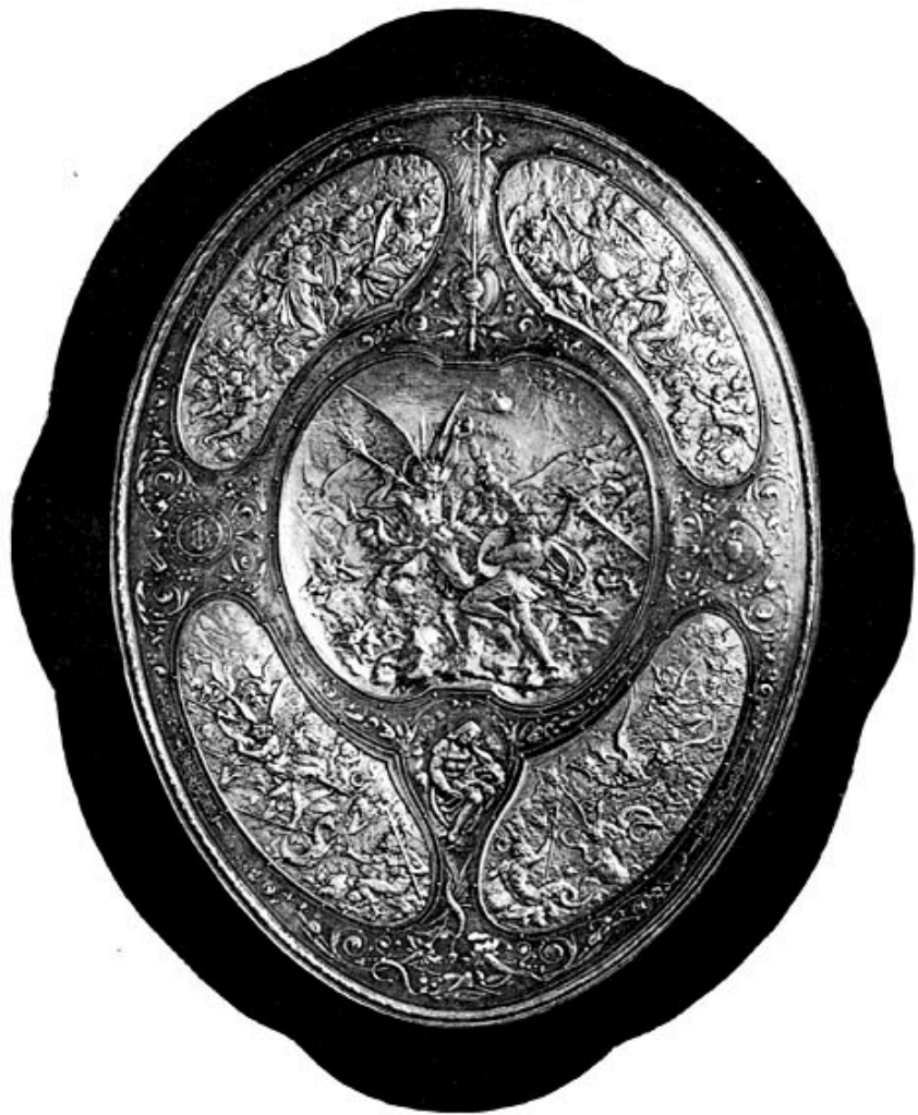
The Pilgrim's Shield